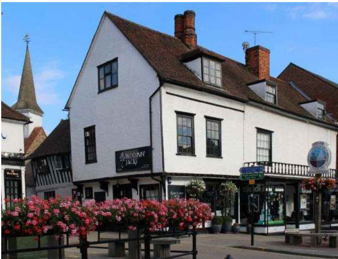
Chipping Ongar Town Centre

Appendix- Projects and Actions Regulation 14 Consultation Version December 2020